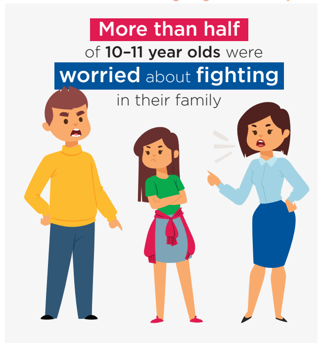
Figure 12.1: More than half of 10-11 year olds were worried about fighting in their family